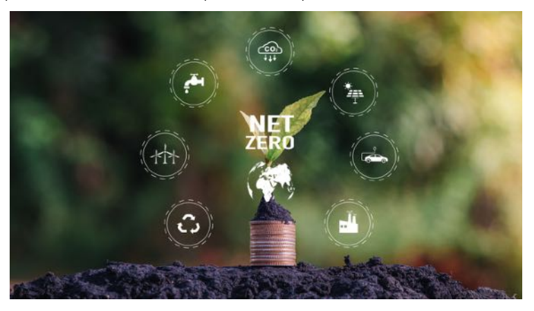
BlueOperation offers the most suitable digital environment for measuring and reducing the carbon footprint process.